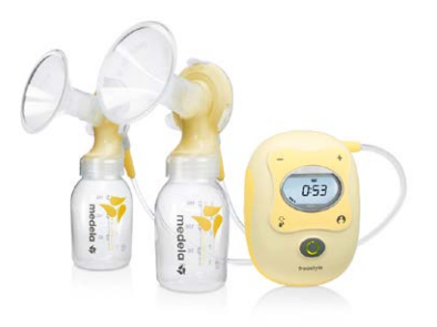
Freestyle™ double electric breastpump all-in-one – innovative – time-saving

Swing maxi<sup>™</sup> double electric breastpump highly efficient – comfortable – quick