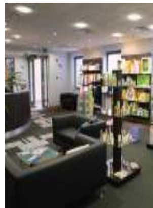
Medicare Health & Living Umamma Store