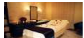
U Mamma Treatment Room